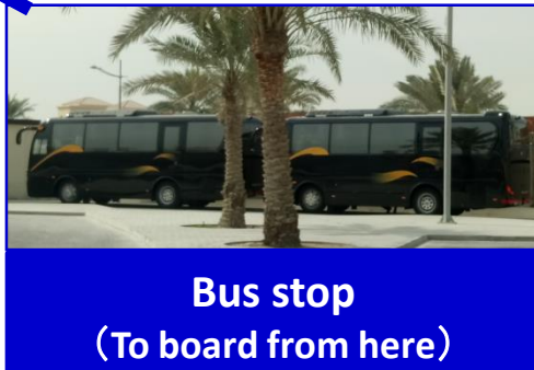
Bus stop (To board from here)

Address: Al Shabab Street, New Diplomatic Area, Onaiza, Doha, The State of Qatar P.O. Box 2208